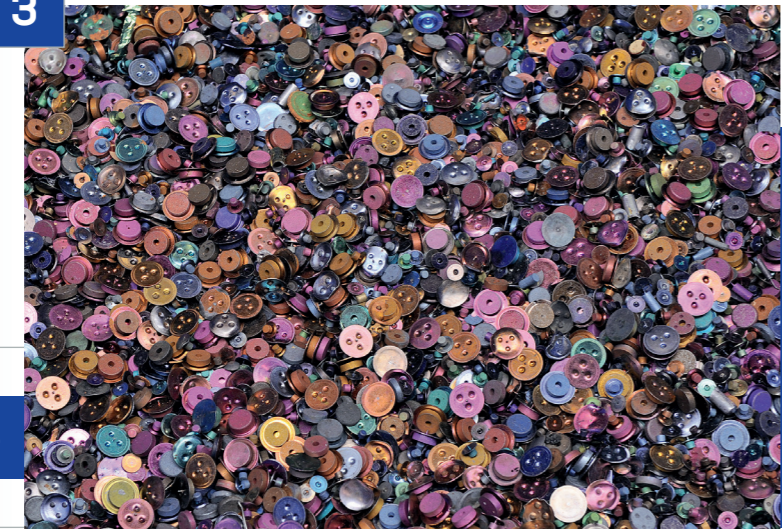
RARE EARTH METALS